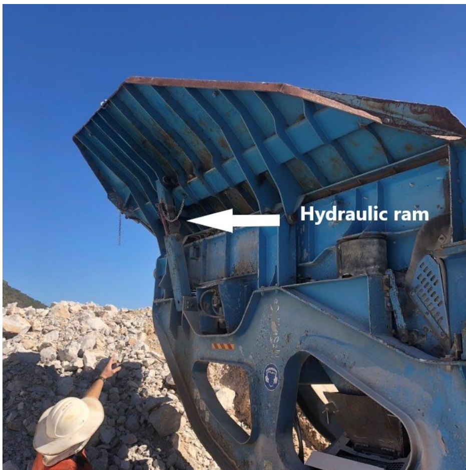
Figure 1: Arrow pointing to the hydraulic cylinder (ram) that normally raises and lowers the wing of the crusher.

At the time of the incident, the injured worker is reported to have been located underneath the hopper operating the hydraulic controls of the mobile crusher. The worker sustained a serious laceration to an ear and was transported to the Mudgee Hospital for treatment.