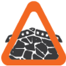
Ground or strata

See recommendations from incident number IncNot0040098 above