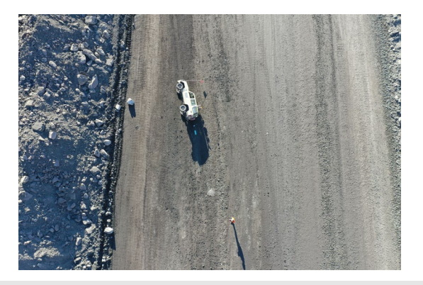
Dangerous incident IncNot0040784 Underground metalliferous mine