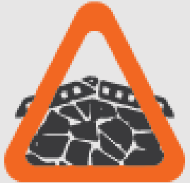
Ground or strata failure

A jumbo was conducting rehabilitation work for a mine expansion. A fall of ground occurred while fitting the mesh to the roof. The area had not yet been supported. The right-hand boom was buried under rock. The nipper was standing behind the jacks of the machine and the operator was in the cab. Both workers were uninjured.