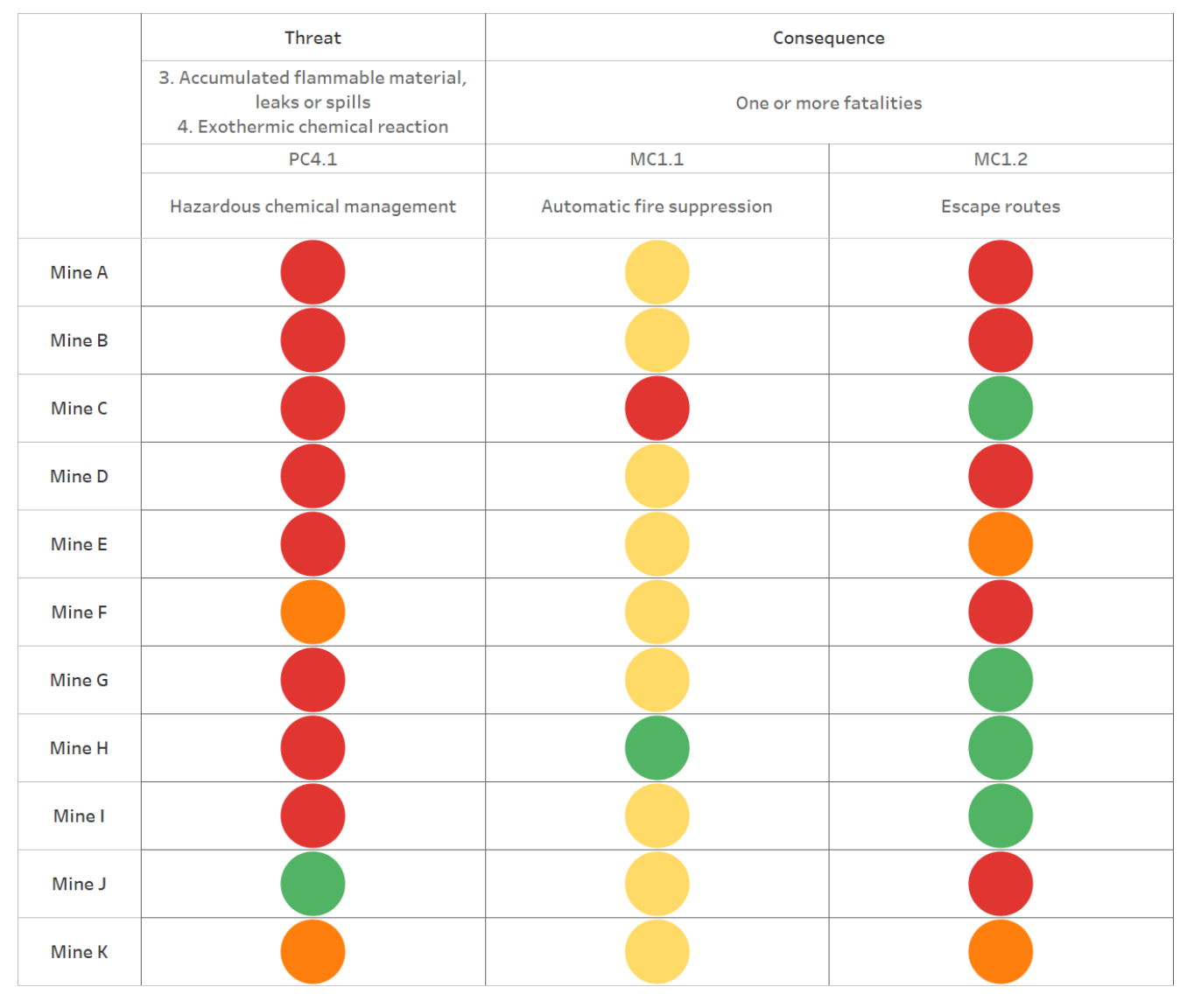
Figure 1. Assessment finding results for the planned inspection program fire or explosion - surface coal mining – overall results < 80%

This table presents aggregate assessment finding results by critical control, providing a summary view of the status of each mine's hazard management processes. Importantly, the system recognises the value of fully implemented and documented controls by awarding an additional point if both elements were assessed as present. More details explaining the assessment system are found at Appendix B.