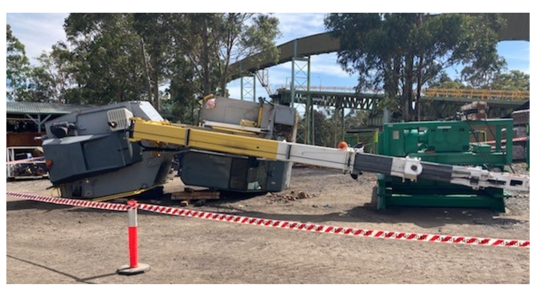
Figure 1-Articulated mobile crane overturned-cause still under investigation.

A 25 tonne pick and carry articulated mobile crane (see figure 1) was being used to relocate a belt winder that weighed approximately seven tonnes. During the relocation, the crane was articulated and slowly rolled onto its side. The operator was uninjured and was able to exit the crane.