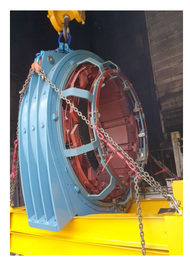
Figure 3 - Motor stator (left) - restrained after fall and brake disc (right)

A 20 tonne overhead crane was being used to lift a motor stator weighing 18.3 tonne up to the motor room of a powered winding system. Approximately 10 metres off the ground the crane stopped without input from the operator and the load descended, landing on the transport frame it was lifted from. The crane brake that applied automatically failed to hold the load but did slow its descent.