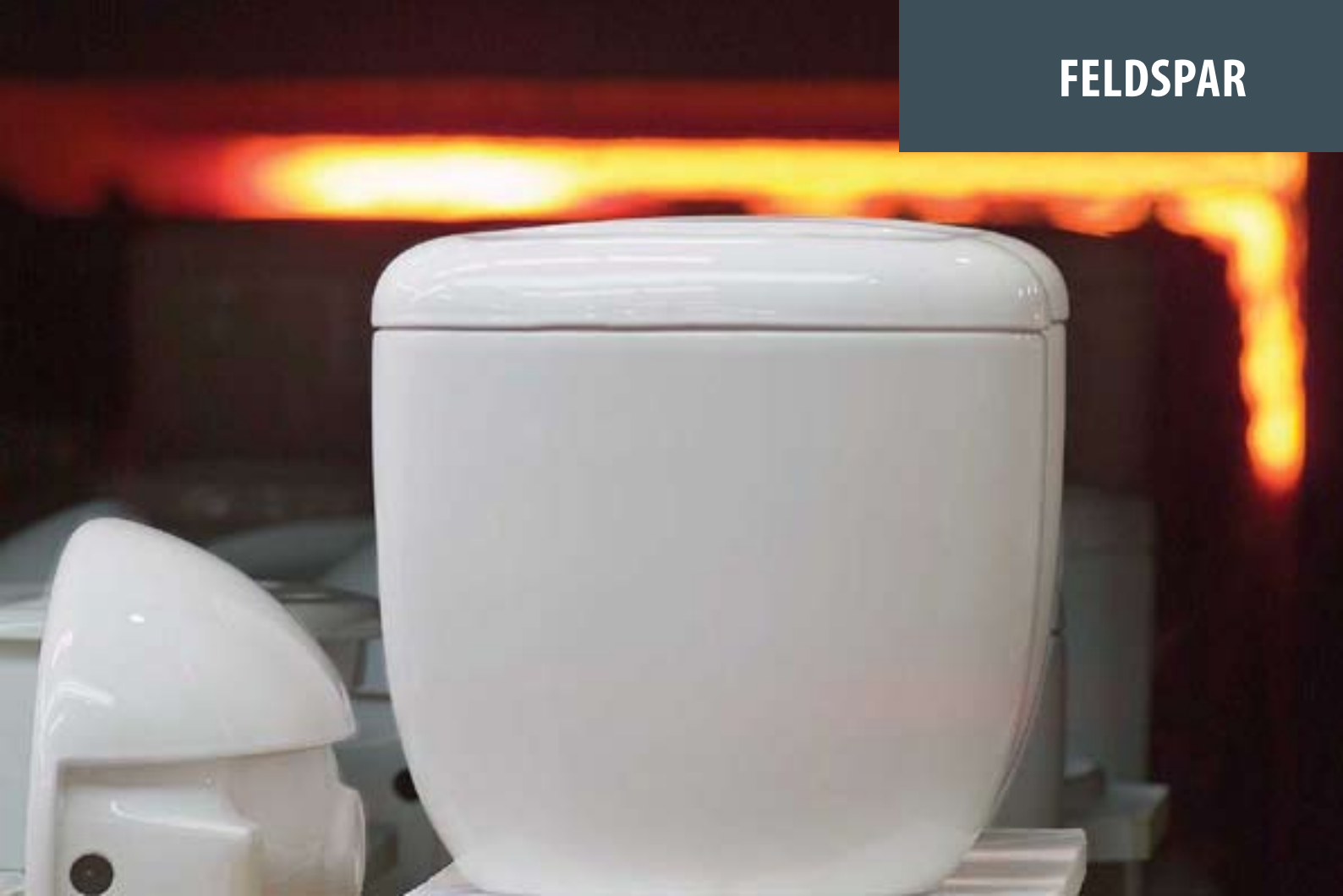
Photograph 6. Ceramic whiteware products emerging from a kiln, Caroma Industries ceramics plant, Sydney. Raw materials most commonly used in porcelain manufacture are feldspar, as a flux, and kaolin, as the clay or plastic fraction. Slow heating of the material in a kiln (depicted) produces a solid, strong and non-porous structure with a permanent glassy surface. (Photographer D. Barnes)