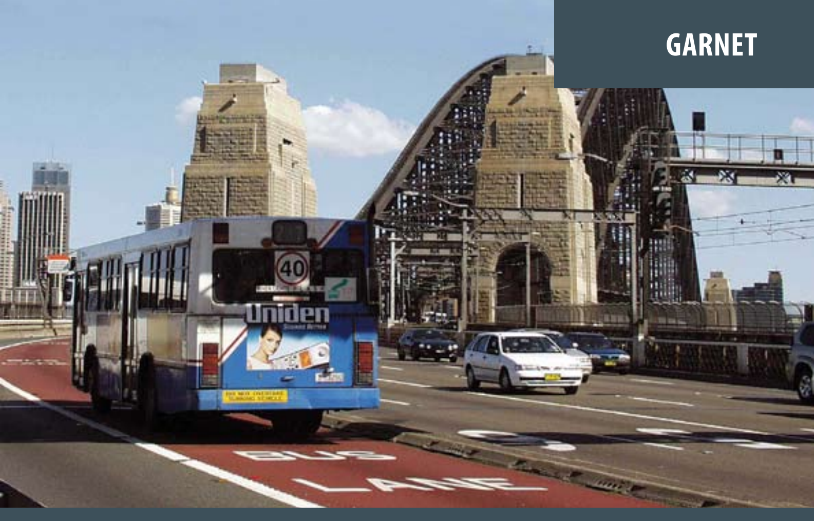
Photograph 7. Garnet used as skid-resistant aggregate in bus lane surface, Sydney Harbour Bridge.