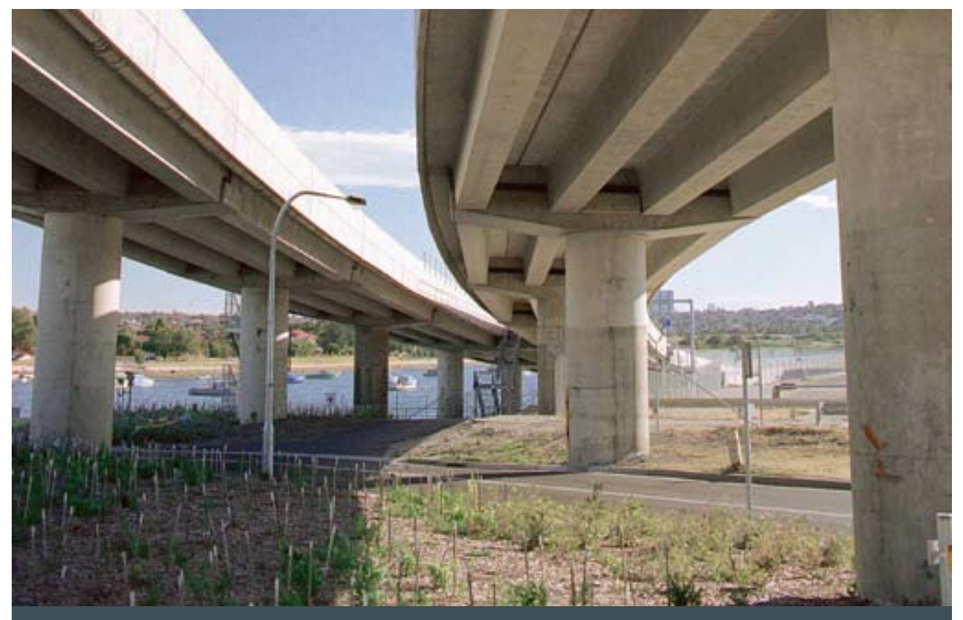
Photograph 12. Limestone is a major raw material used in cement in many construction applications. Apart from cement manufacture, other uses for limestone include manufacture of lime, coarse aggregate, metallurgical flux, filler materials, glassmaking, ceramics and chemicals.

At some stage in the future, populations in regional centres may increase to the point where regional cement plants become economic. Higher purity limestone is mined at several centres for other uses — such as fillers, glass, coating and whiting agents, and agricultural lime. Current production is aimed at the relatively small domestic market. Most plants need to produce both high and lower grade (e.g. ground limestone for agricultural use) products to survive.