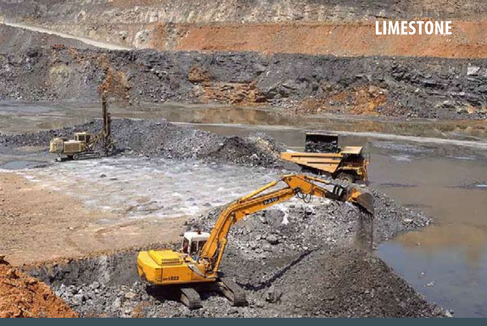
Photograph 10. Kandos limestone quarry, Kandos. Limestone from the Kandos quarry is used in cement manufacture on-site. The ideal grade of limestone for cement manufacture is around 70–80% calcium carbonate. The Kandos plant operates two kilns, producing about 450 000 tonnes of cement each year, which is sold entirely into the New South Wales market.