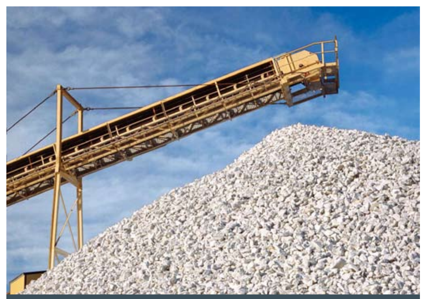
Photograph 11. Limestone stockpile at the Omya Limited processing plant at Bathurst. Omya Southern Pty Ltd mines high-quality limestone at Cow Flat, near Bathurst. The company produces a range of ground calcium carbonate products at the on-site processing plant for use as filler materials and in chemicals.

and limestone-based products are commodities with only medium unit-value.