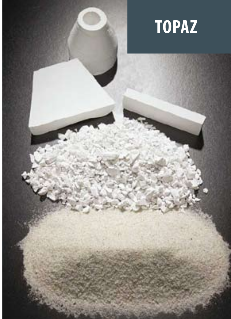
Photograph 23. Topaz, mullite sand and products. The topaz was obtained from the Torrington silexite deposit, New England region. Mullite is a synthetic, fused (calcined) crystalline aluminium silicate produced in electric arc furnaces from alumina and silica for such applications as refractory tubes, industrial crucibles, analytical equipment and refractory cements.