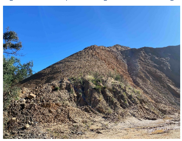
Figure 5 Soil stockpile with vegetation establishing