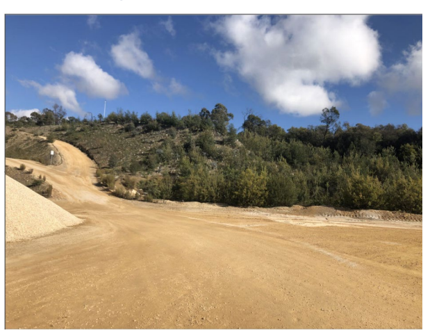
Figure 11 Vegetation on the visual amenity bund (plate 13 of Wallerawang Quarry annual review, September 2020)