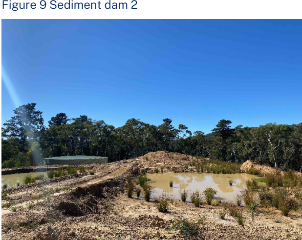
Figure 9 Sediment dam 2