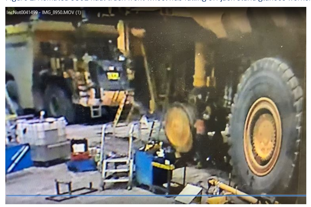
Figure 2: Komatsu 930E haul truck front wheel hub falling off jack stand glances worker

Three workers were removing the front wheel hub from a Komatsu 930E dump truck. The wheel hub fell to the ground after the tapered connection between the wheel hub and spindle was released. The hub, weighing about 4.8 tonnes, fell from the single jack that was set up to support it. The workers narrowly avoided injury from the falling hub.