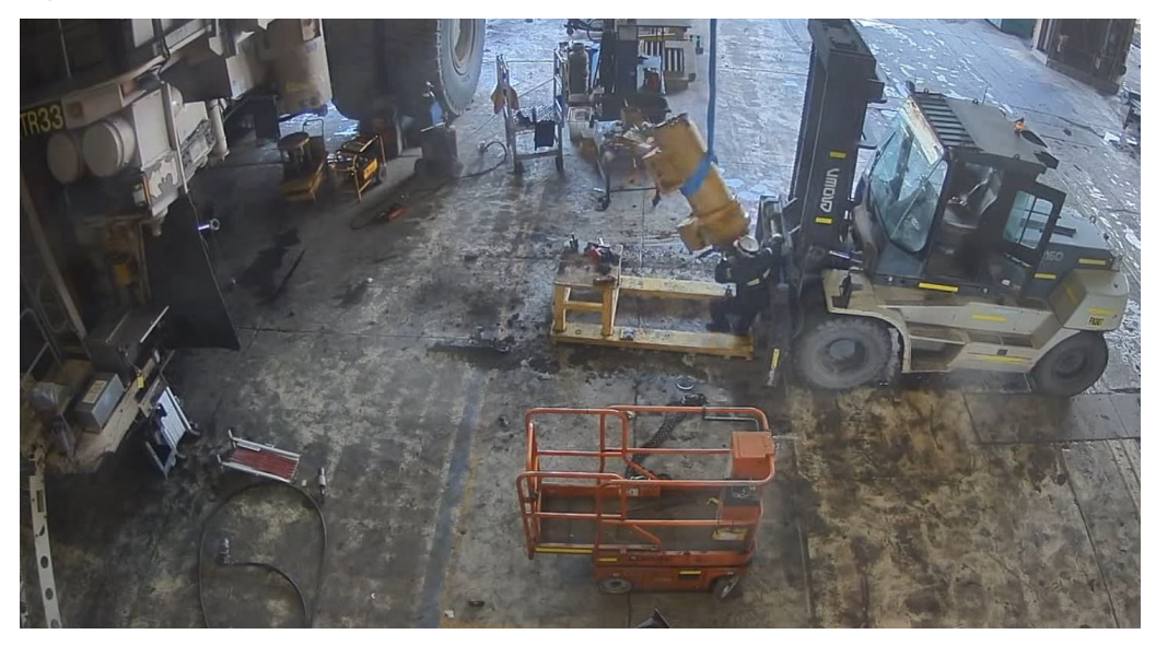
Figure 3: Front strut suspended from overhead crane hits worker

The worker began undoing the bolts holding the strut to the jig, however the strut moved, so the worker applied more load with the overhead crane. When the last bolt was undone, the strut started to swing and pushed the worker against the mast of the forklift as he tried to move away from the strut. The worker was not injured.