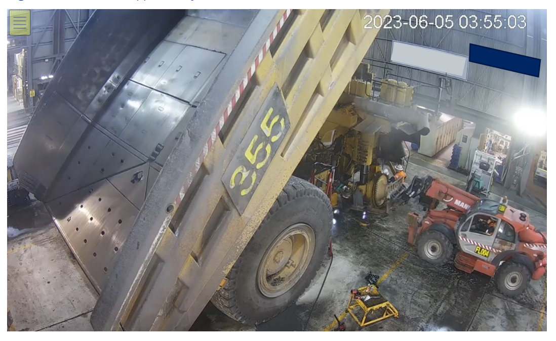
Figure 4: Front strut supported by telehandler hits worker

Workers were changing out a front wheel hub assembly on a Caterpillar 789 haul truck in a workshop. While removing the wheel hub from the taper, the assembly unexpectantly moved. The assembly was fixed to a frame that was sitting on the tynes of a telehandler. The tynes dropped when the load moved. A worker in close proximity was hit in the face. The worker suffered minor grazing.