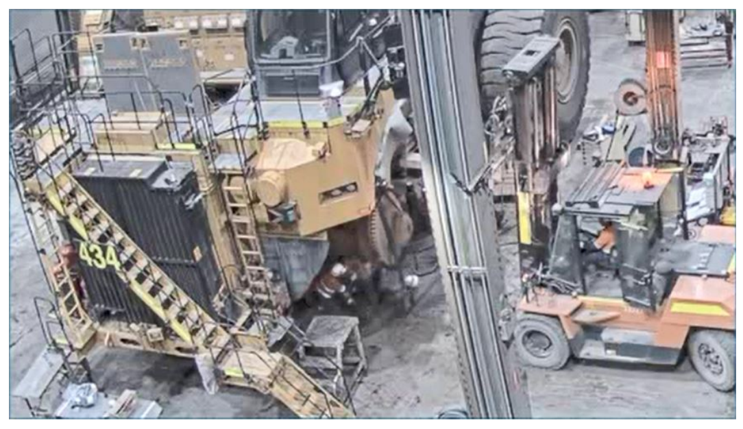
Figure 5: Caterpillar 795F front wheel hub assembly supported by forklift during dismantling hits worker

Workers were disassembling a Caterpillar 795F haul truck front strut in situ using a forklift to support the wheel hub assembly. A worker was below the wheel hub was removing strut bolts with a rattle gun. The wheel hub released from the strut taper, making contact with the worker, knocking them to the ground. The worker was not injured.