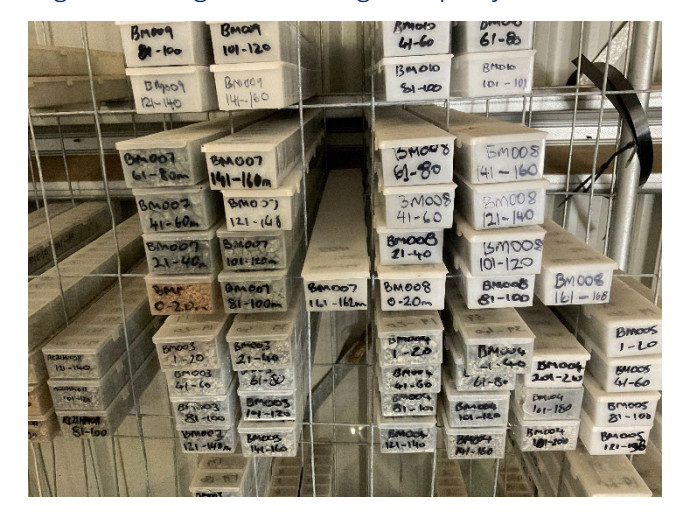
Figure 8 Core tray storage in the core yard at Harden