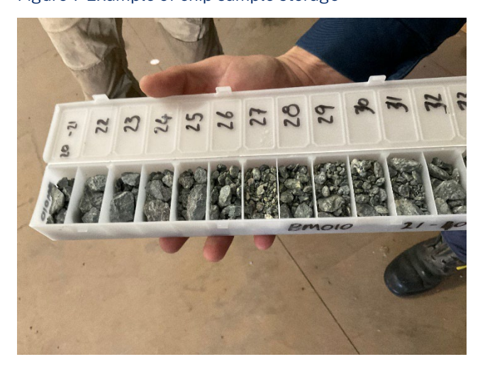
Figure 7 Example of chip sample storage