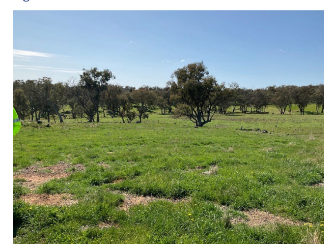
Figure 2 Rehabilitation of RC hole BM010