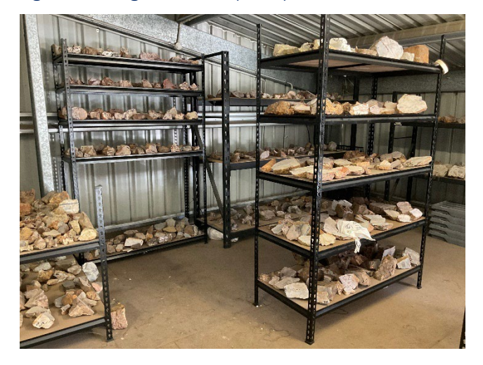
Figure 7 Example of chip sample storage