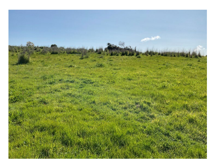
Figure 2 Rehabilitation of RC hole BM010