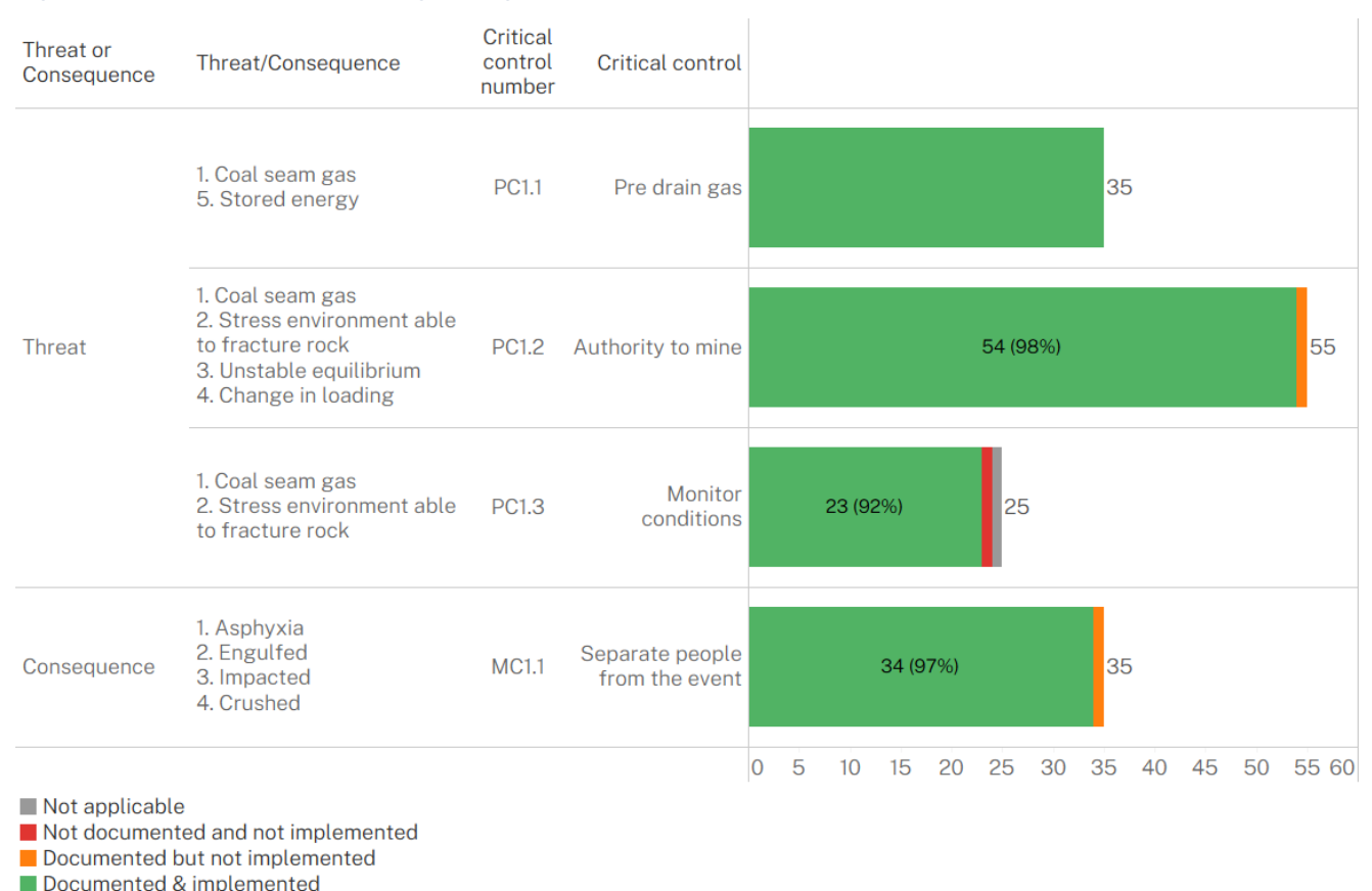
Figure 3. Overall assessment findings ratings by critical control

In summary the overall findings ratings by the critical controls assessed were: