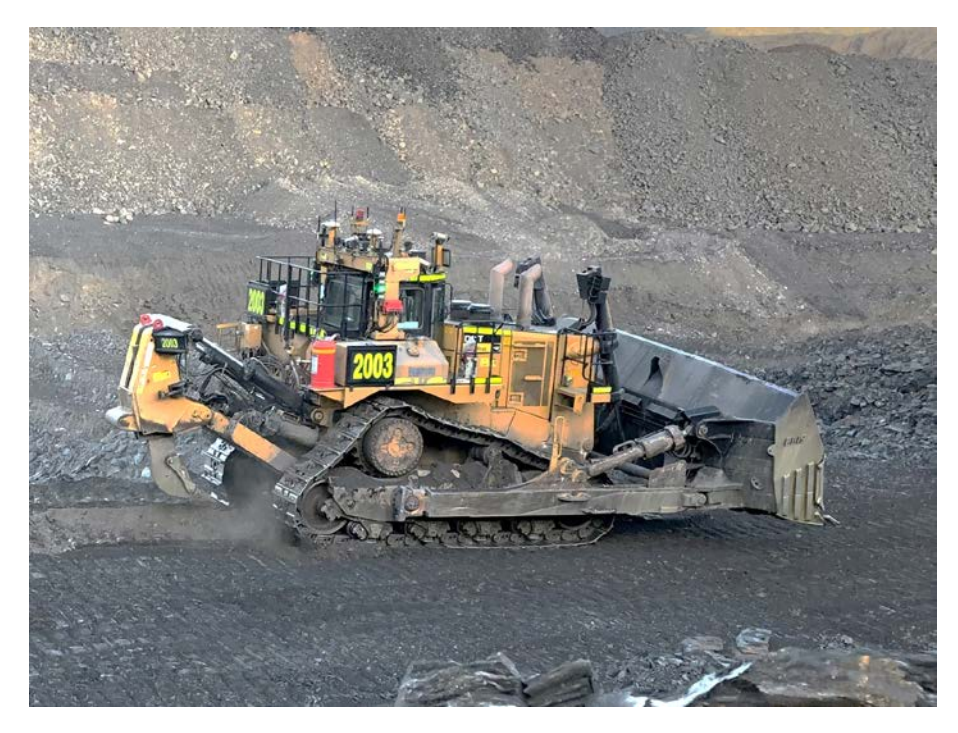
Figure 5 A dozer with modifications for semi-autonomous operations

If a dozer operating semi-autonomously fails to move as expected, it faults and requires an operator to select the machine and reinitiate the semi-autonomous operation.