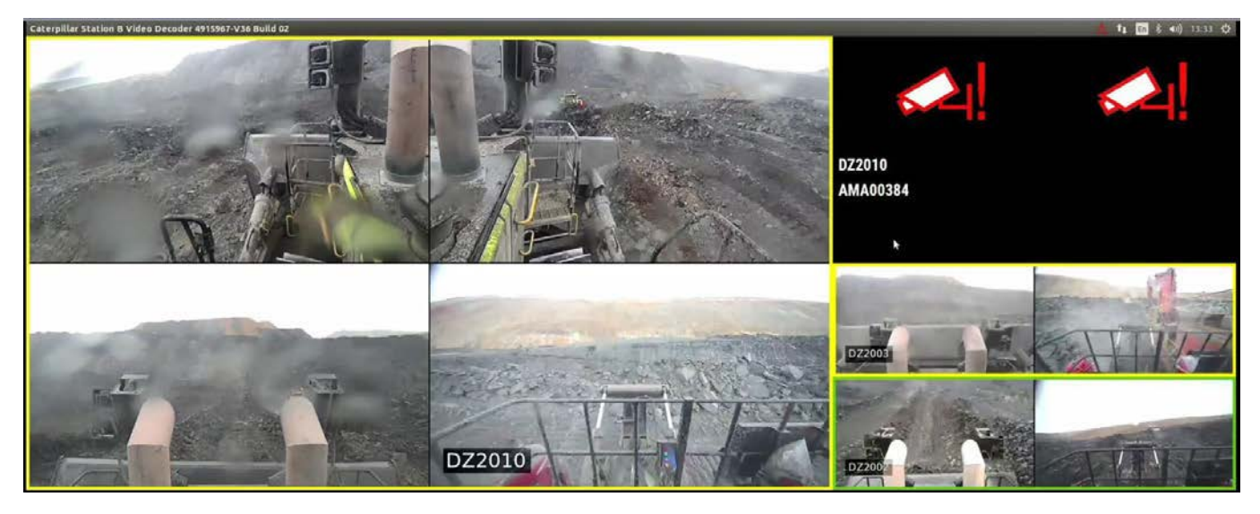
Figure 1 Overview of the SATS operator camera display screen immediately before the incident

When in semi-autonomous mode, the dozers can only conduct pushing operations in a designated slot within the avoidance zone.