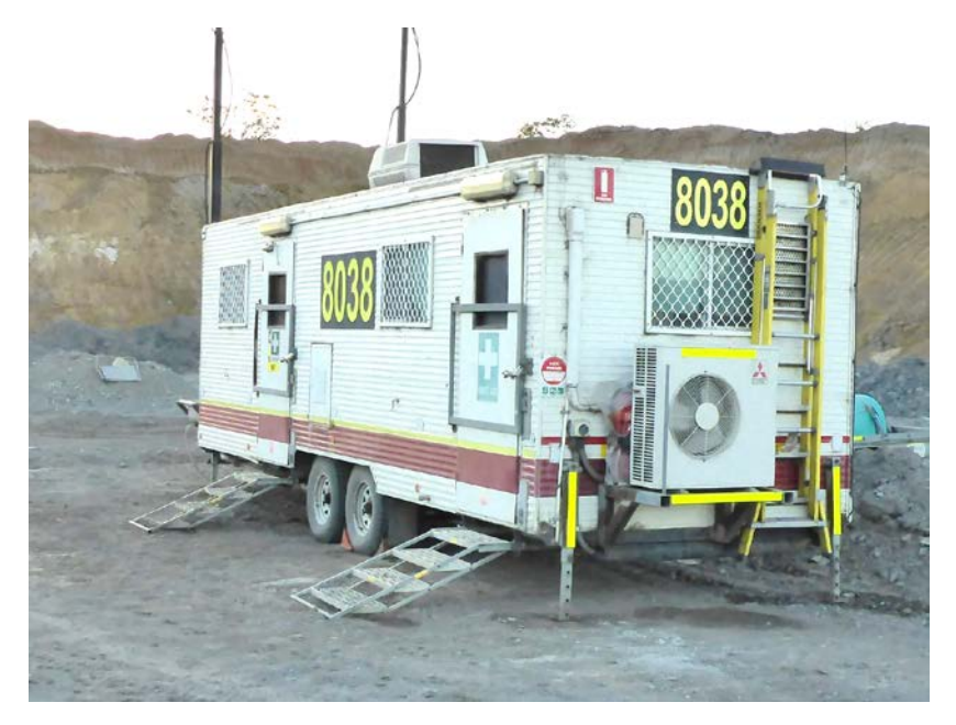
Figure 7 The remote operator station (ROS) inside the command for dozer control centre

Figure 6 The command for dozer control centre