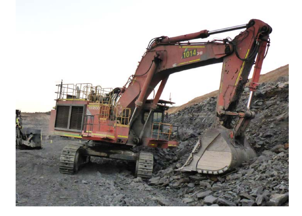
Figure 4 The Hitachi hydraulic excavator