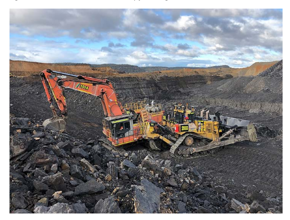
Figure 8 The incident scene immediately following the collision