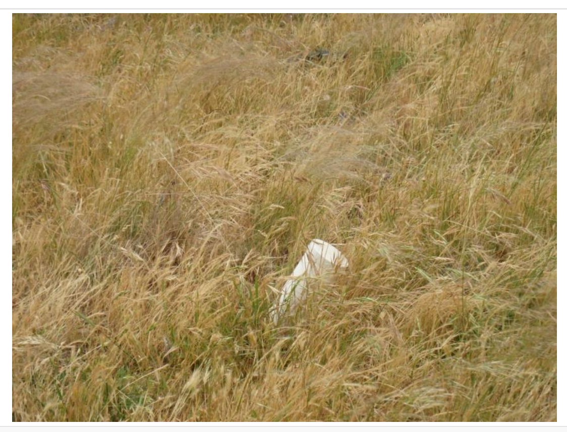
Photo 1 – Casing protruding from the ground on a rehabilitated borehole site