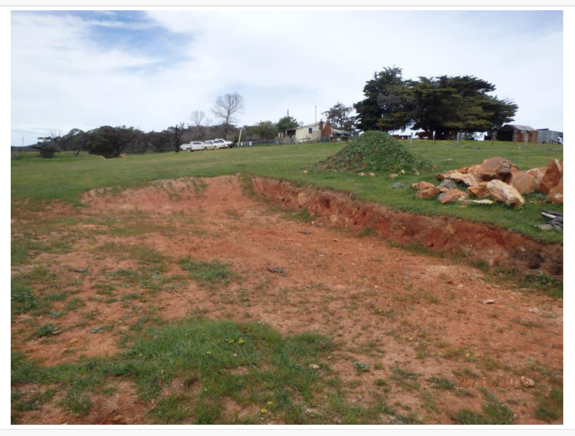
Photo 6 - Unrehabilitated drill site - drilling was completed in early 2016