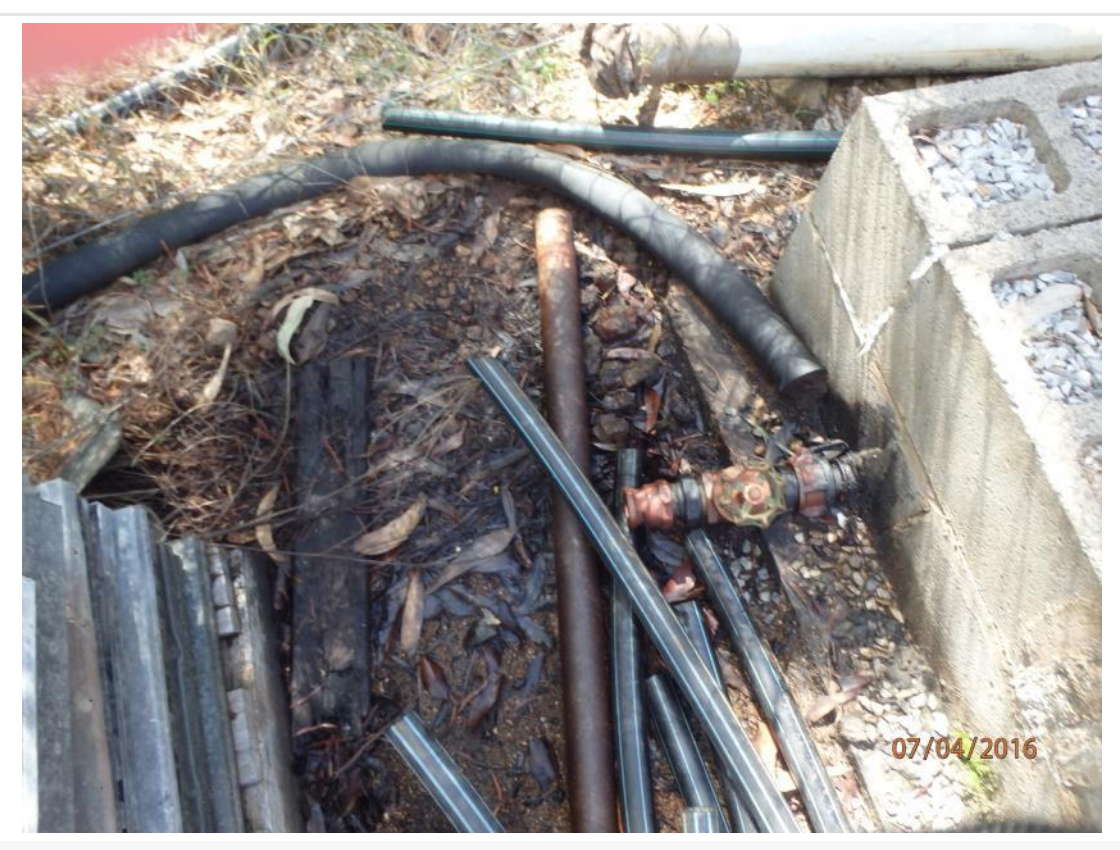
Photo 3 - Bund drain left open discharging potentially contaminated water