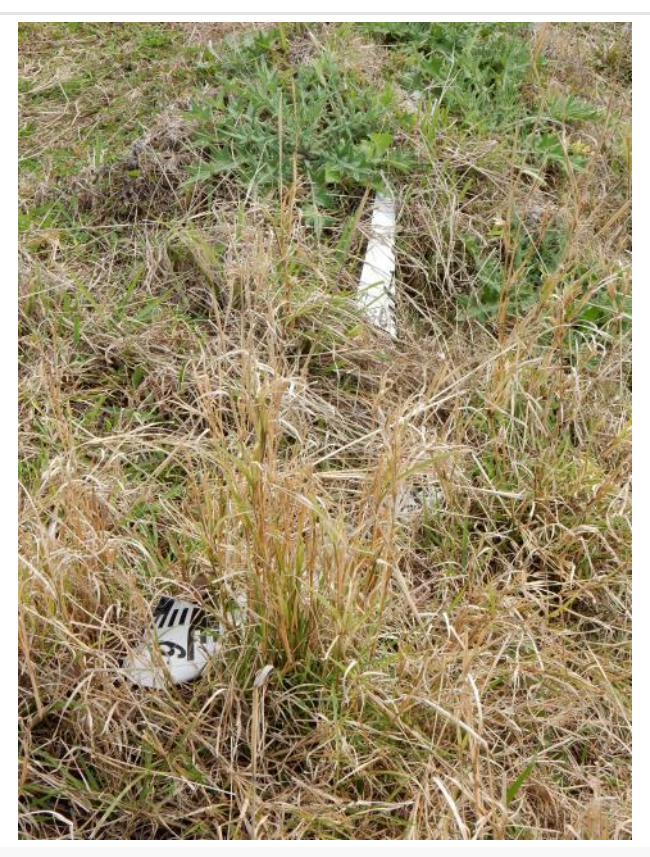
Photo 9 – Damaged gauge marker board on a major water storage at one site