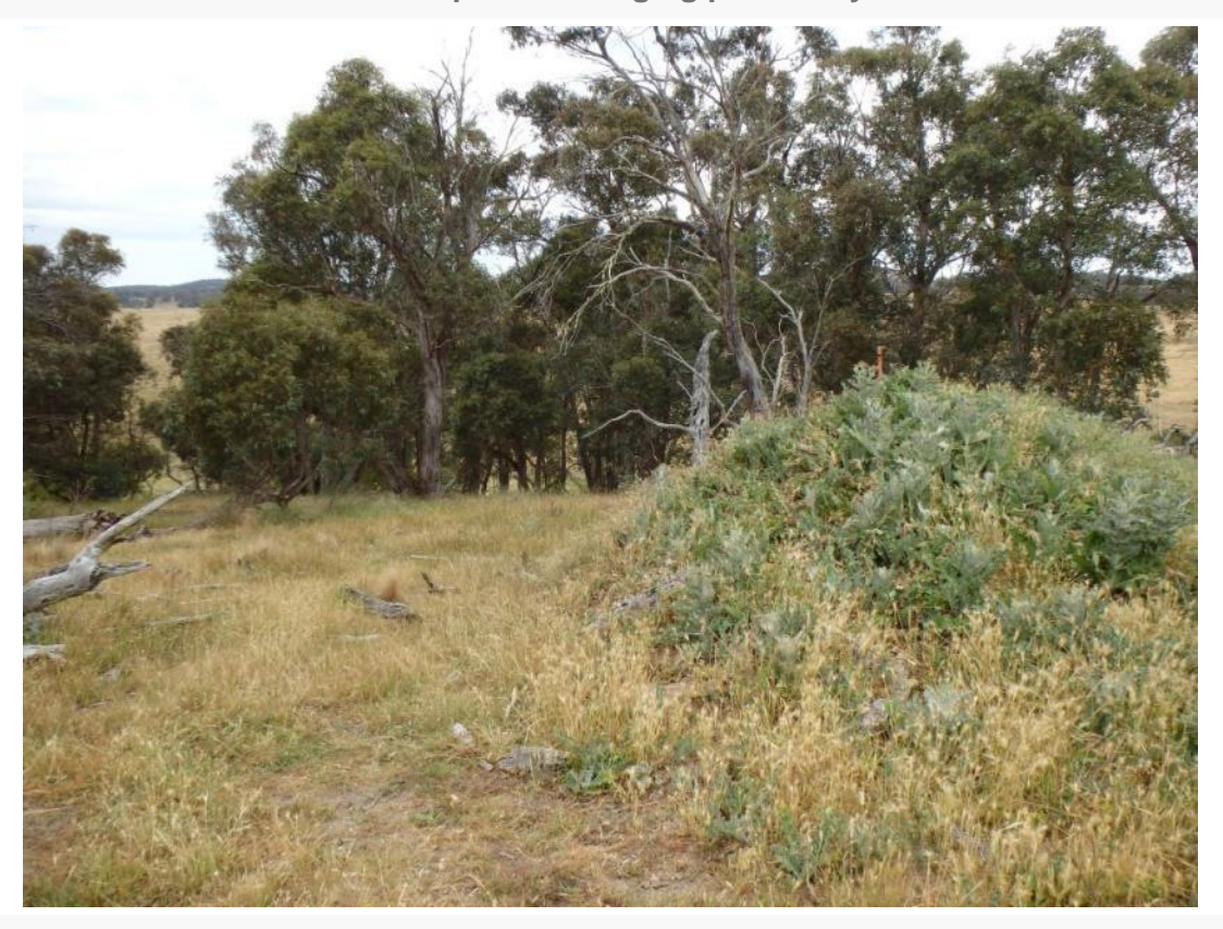
Photo 4 – Topsoil stockpile at a drill site – note no sediment controls and weed infestation