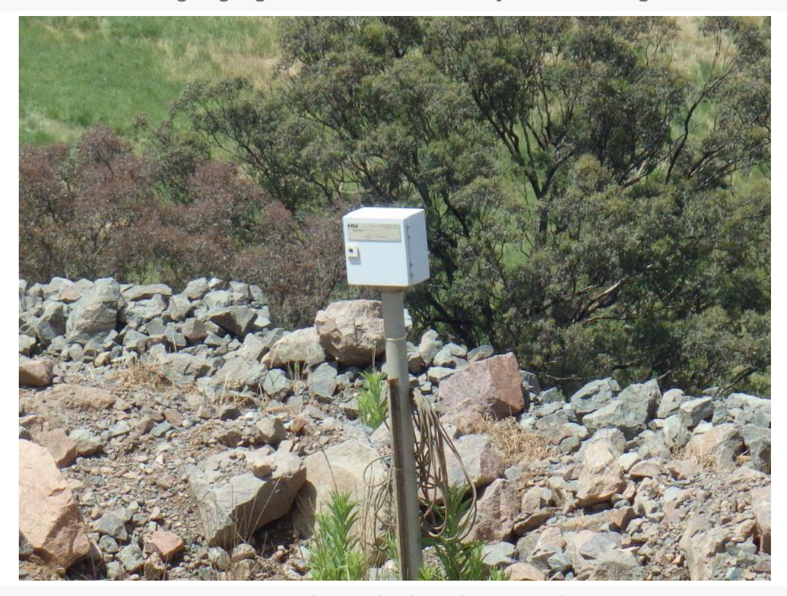
Photo 10 – Example of automatic monitoring piezometer installed on a dam wall