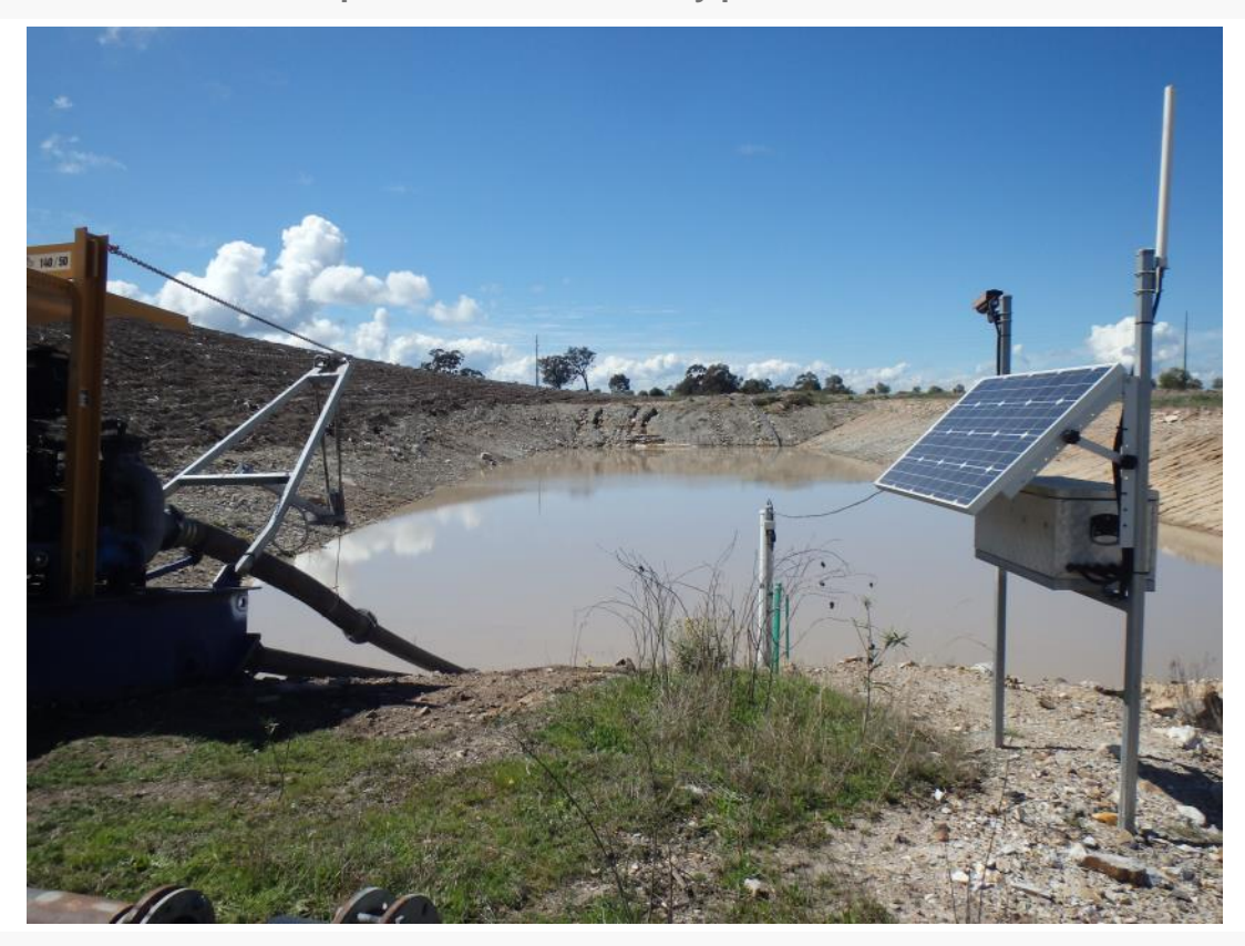
Photo 12 – Example of solar powered automatic water level sensor and webcam installed on a sediment dam