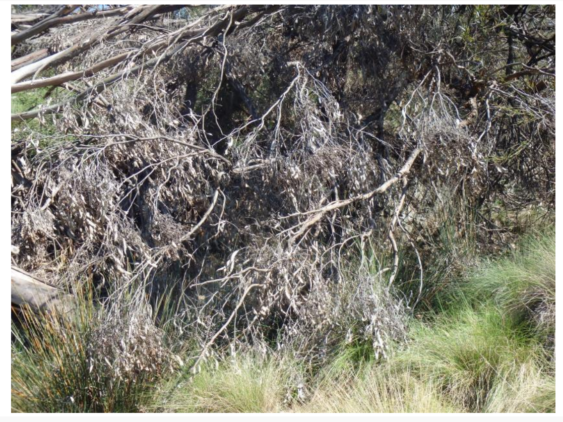
Photo 8 – Fallen tree blocking the grassed spillway on a sediment dam