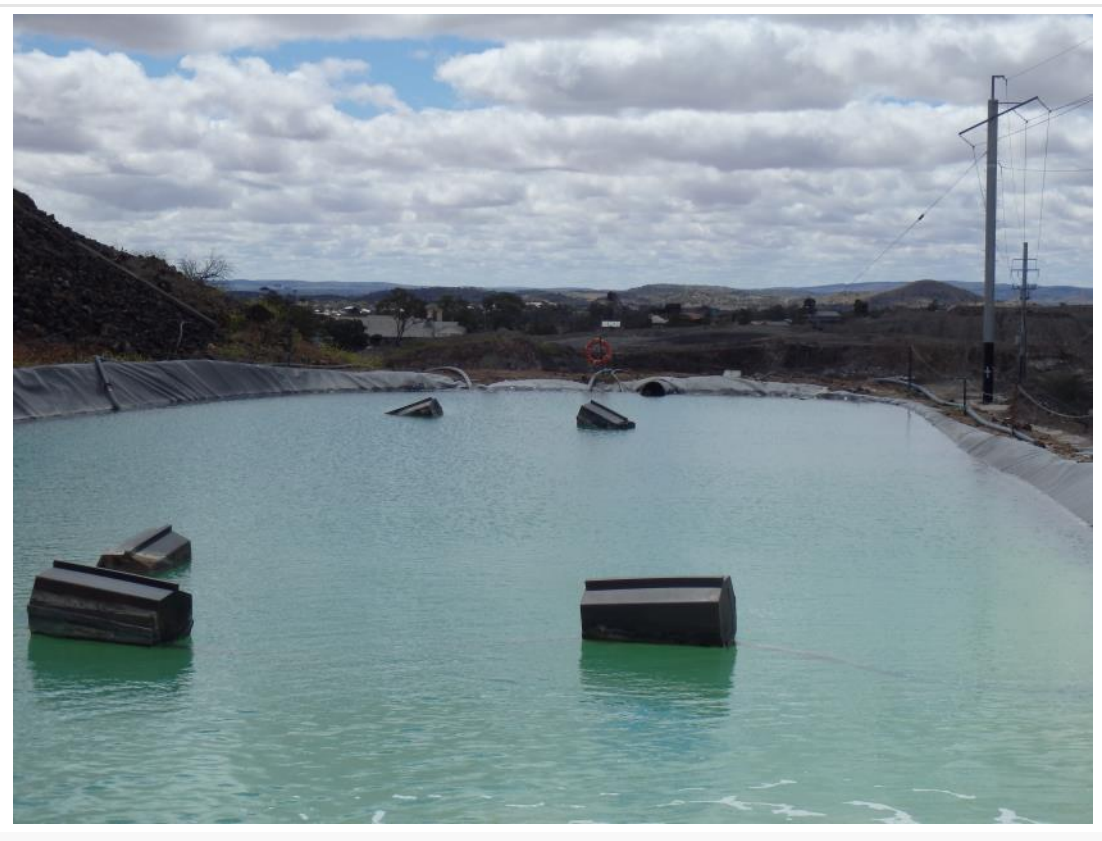
Photo 7 – Inadequate dam wall construction with no operational freeboard and a noticeable low point in the dam wall