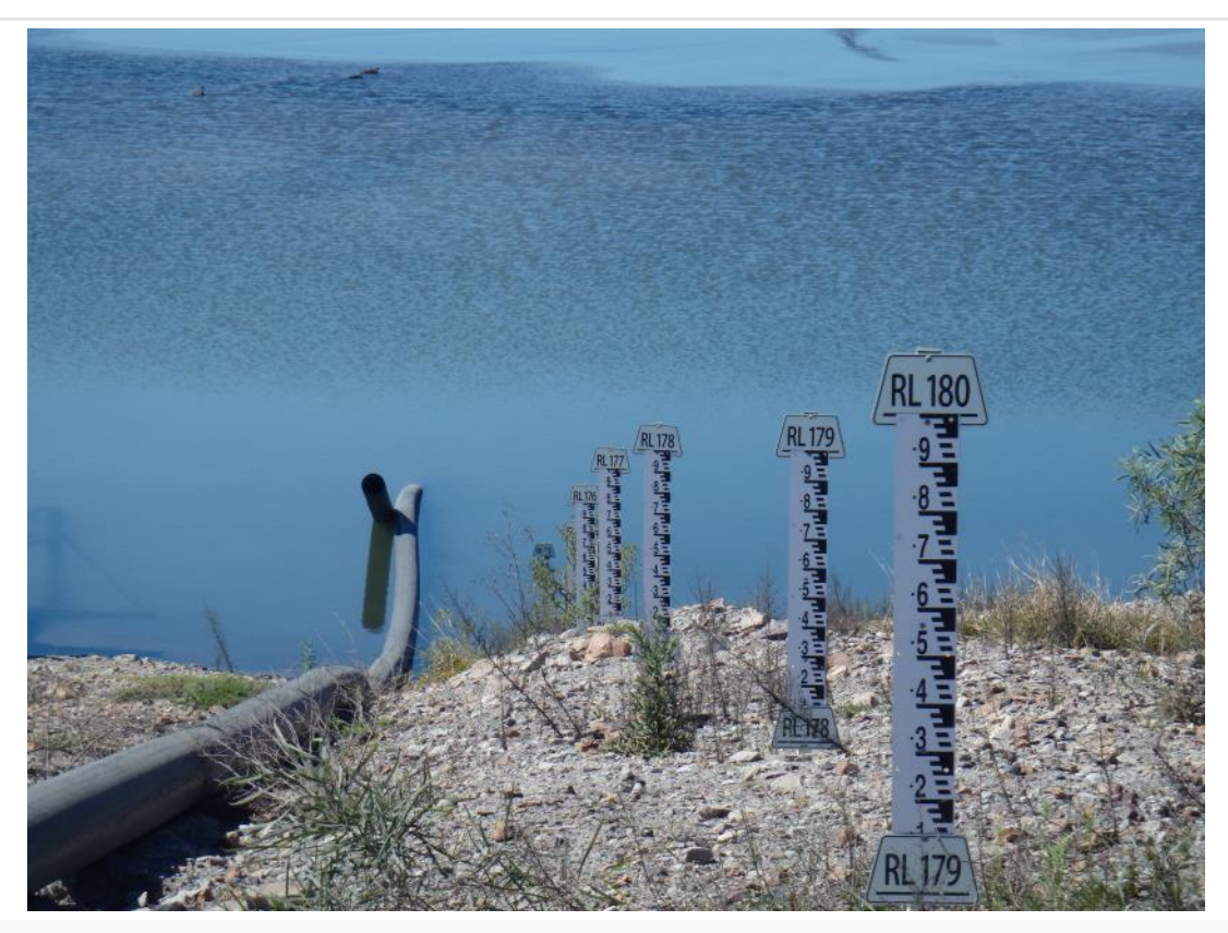
Photo 13 – Example of manually read gauge marker boards in a tailings dam