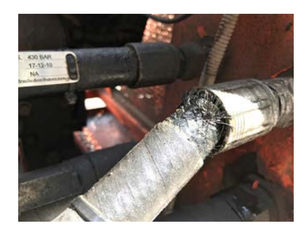
Figure 7: The failed hydraulic hose on the recovery power pack

A contract maintenance worker was precommissioning a haul truck recovery power pack. The power pack was started without being connected to a host machine or testing equipment. When the worker started the power pack an over-pressurisation occurred, and a hose burst at a fitting. The worker was struck by high pressure fluid.