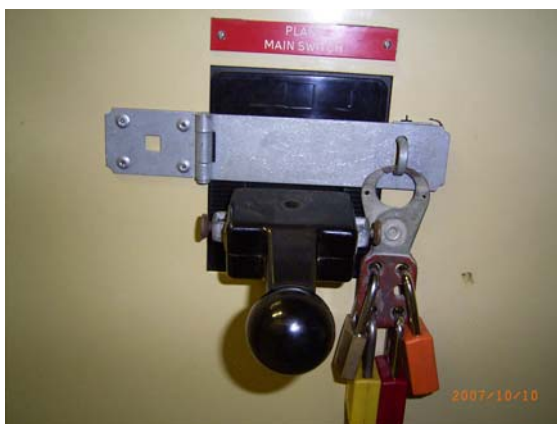
Photograph No 1

An example of two methods used by the mining industry for electrical isolation security is shown in photographs No 1 and 2.