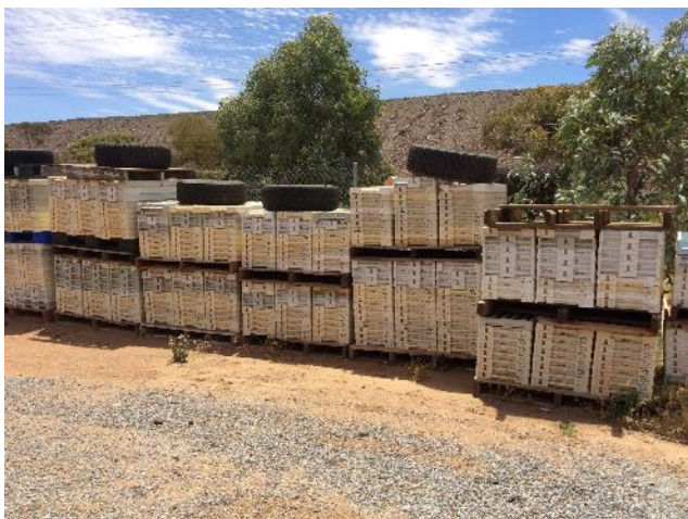
Figure 8 Core storage in the AUSSAM yard in Broken Hill