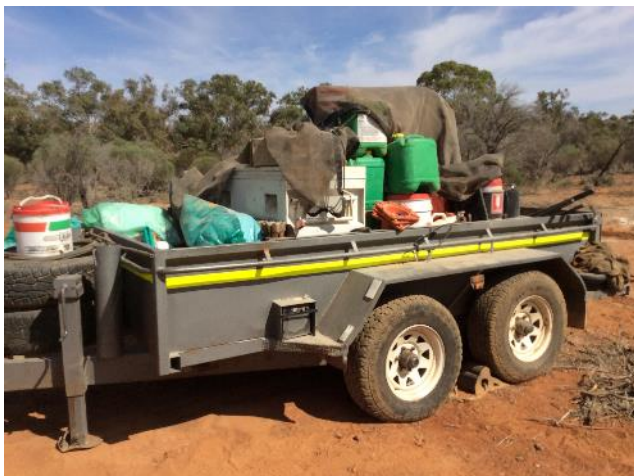
Figure 2 Drilling chemicals, fuels and oils stored in a box trailer