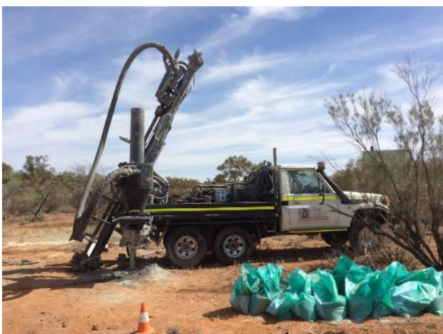
Figure 1 Chief Drilling rig set up at the Platinum Springs area

No evidence of environmental harm, beyond that approved in the exploration activity approvals was observed at the sites visited during the site inspection. A Chief Drilling rig was set up at the Platinum Springs drilling area at the time of the audit (Figure 1). The exploration drilling was observed to be generally undertaken in accordance with the Exploration Code of Practice: Environmental Management as documented in the following sections.