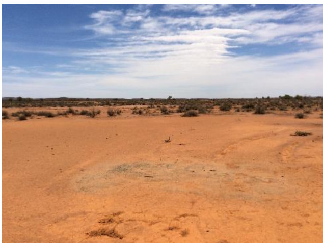
Figure 6 Rehabilitation of hole PN156