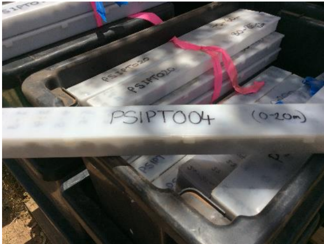
Figure 10 Example of chip tray labelling and storage