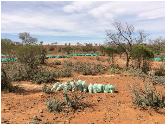
Figure 4 Close spaced drilling in the Platinum Springs area