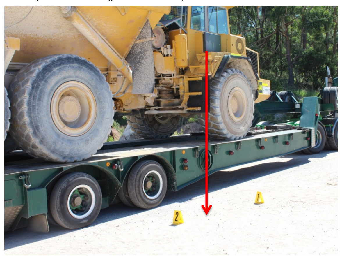
Photograph of the access ladder provided on the off-side of the Volvo A30 dump truck. The red arrow indicates the direction of the fall from the front wheel arch.

A plant operator was preparing to unload a Volvo A30 articulated dump truck that was transported to site on a low loader. During preparation, the operator accessed the top of the right front wheel arch to adjust the side mirror. After making the adjustment, the operator turned and walked toward the access steps where he fell to ground level. The operator suffered a skull fracture in the fall.