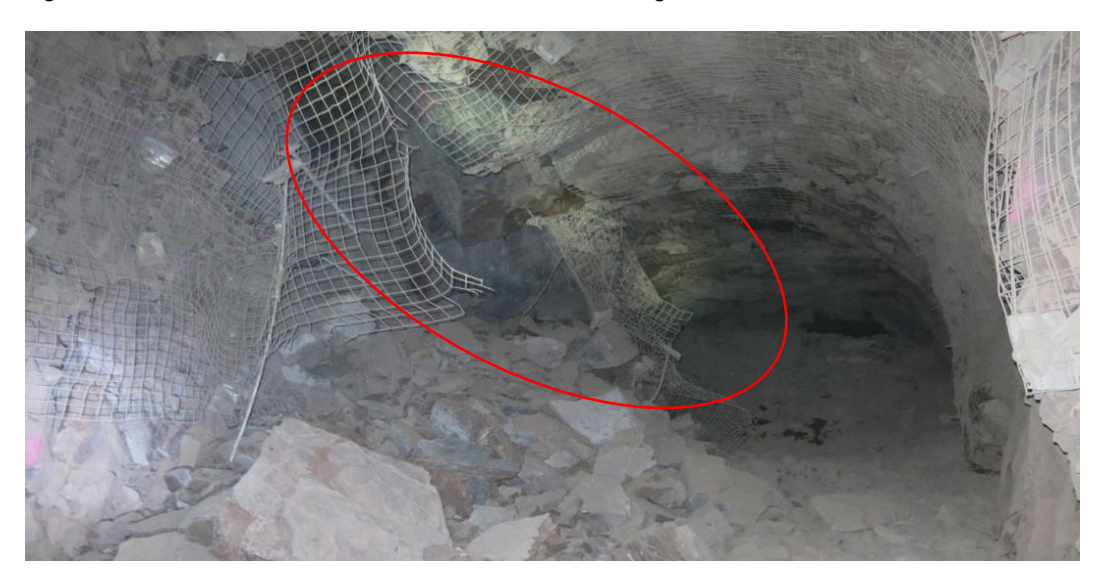
Figure 1: Strainburst from the left shoulder and resulting rockfall.

No people were in the area at the time and no injuries resulted from the rockfall.