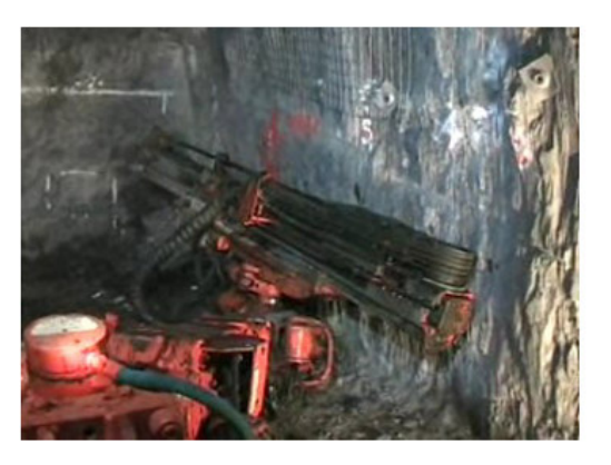
Photograph 4 Reconstruction showing position of the feed beam after the incident