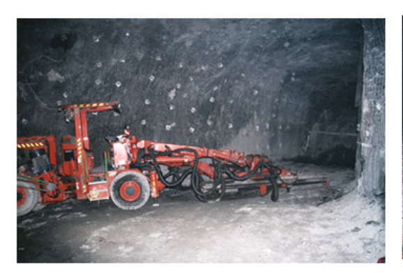
Photograph 1 Side view of the drill jumbo

It would have been simple to position the feed beam on the ground (see photograph 2) before attempting to remove the check valve. This would have eliminated any possibility of the feed beam rotating.