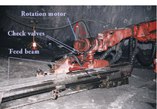
Photograph 2 Feed beam positioned on the ground