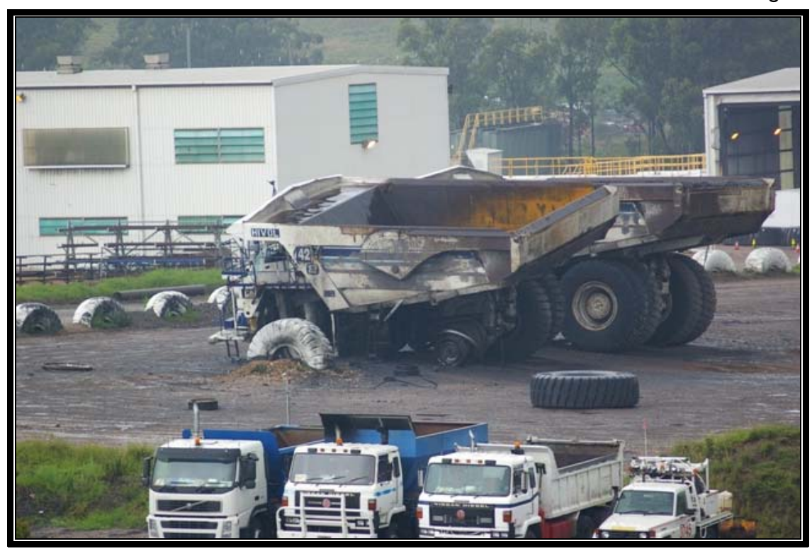
Figure 2: Close-up of the truck