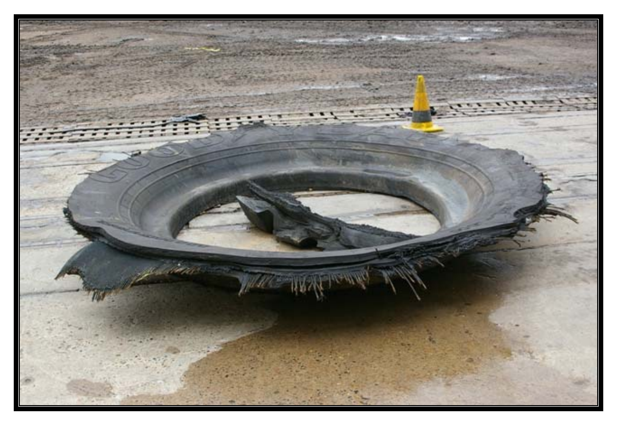
Figure 3: Tyre side wall from position number 1