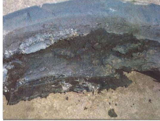
Heat degradation of RL insert