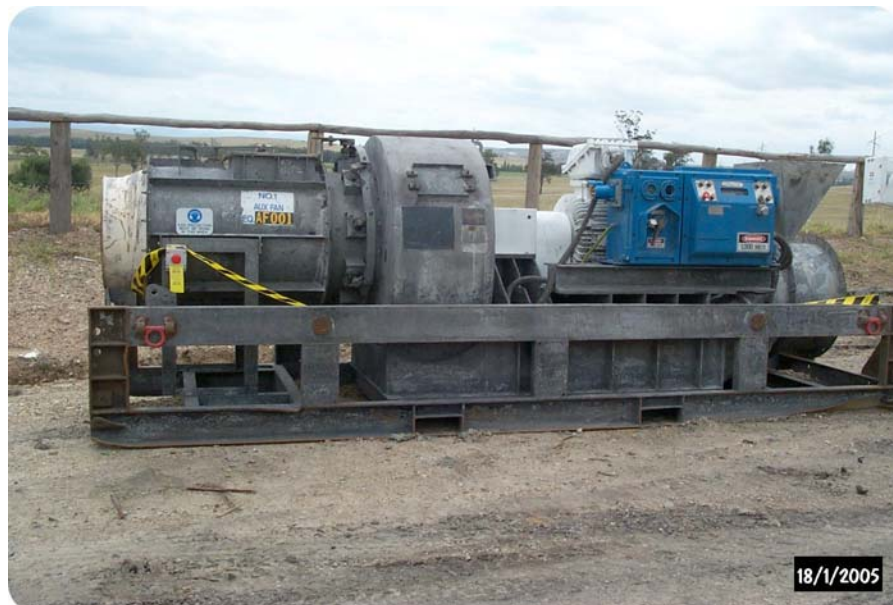
Flameproof Auxiliary Fan

The plastic bung was found by an electrician who was doing diagnostic checks while getting the fan running.