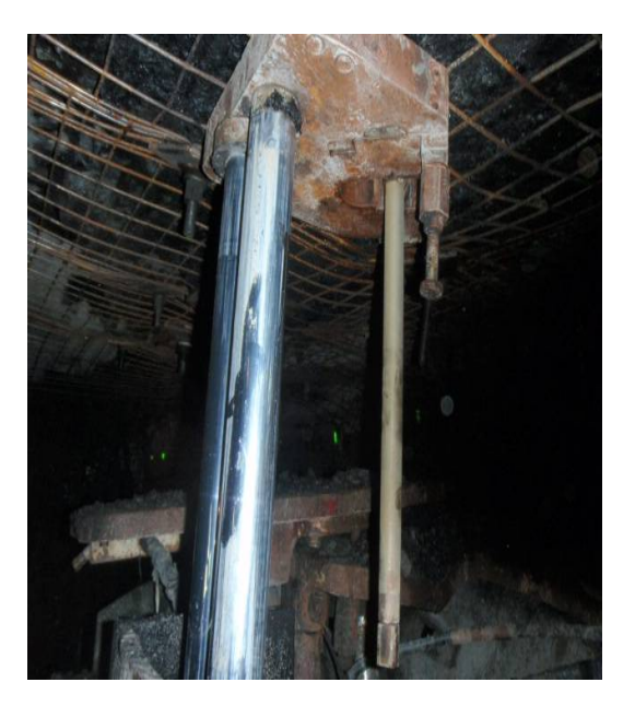
Inadvertent operation of the gripper jaw controls leads to a serious hand injury