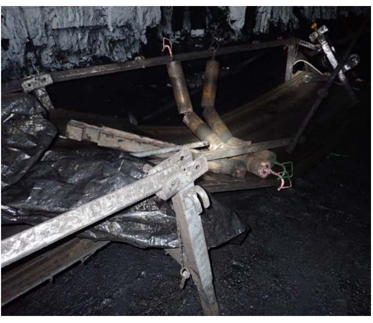
Figure 1 The damaged conveyor structure

An investigation identified that the boot end disengaged from the QDS plate because it was not used, not engaged or misaligned.