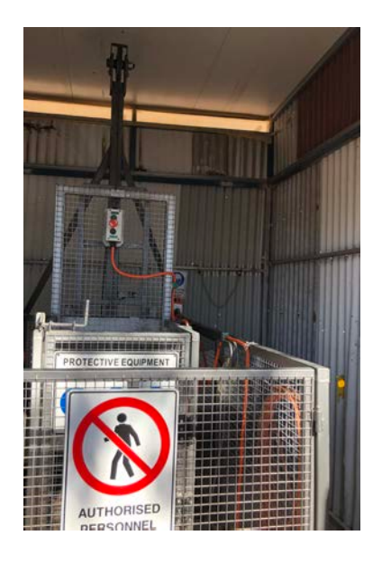
Figures 2, 3 and 4: Arrangement of the hoist showing the conveyance, head sheave and winch drum.

The 8-millimetre diameter non-rotating wire rope lay in a 12-millimetre diameter head pulley groove.