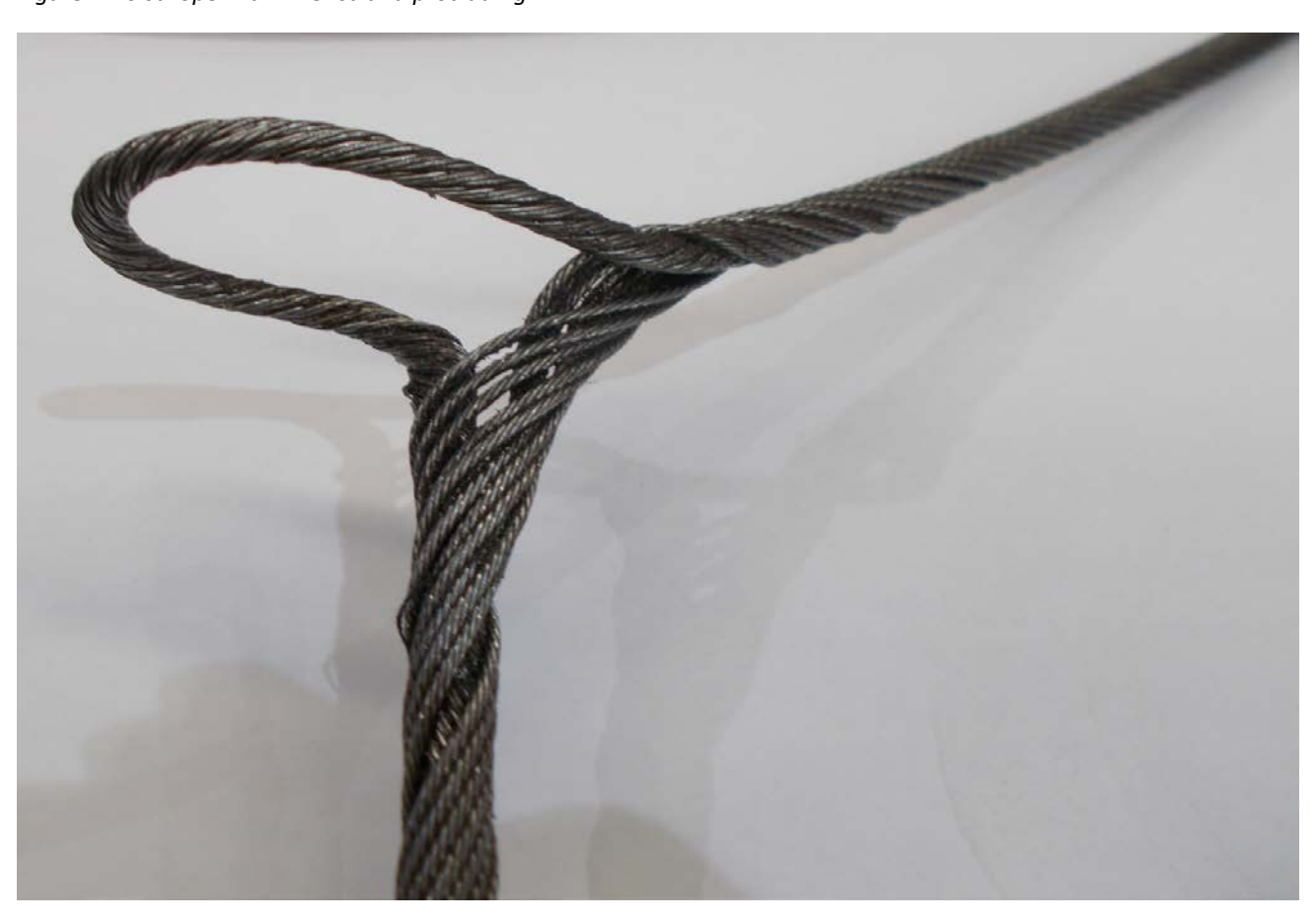
Figure 1 Hoist rope with inner strand protruding

A person-riding gemstone hoist winch rope was found with the inner strand of the rope protruding from the rope lay in two places. This condition reduced the strength of the rope. This may have caused it to break and injure people, on or under the conveyance.