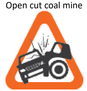
Roads or other vehicle operating areas

The drivers of a light vehicle and a haul truck had to take evasive action to avoid colliding at an intersection. The light vehicle driver stated that he did not see the truck.