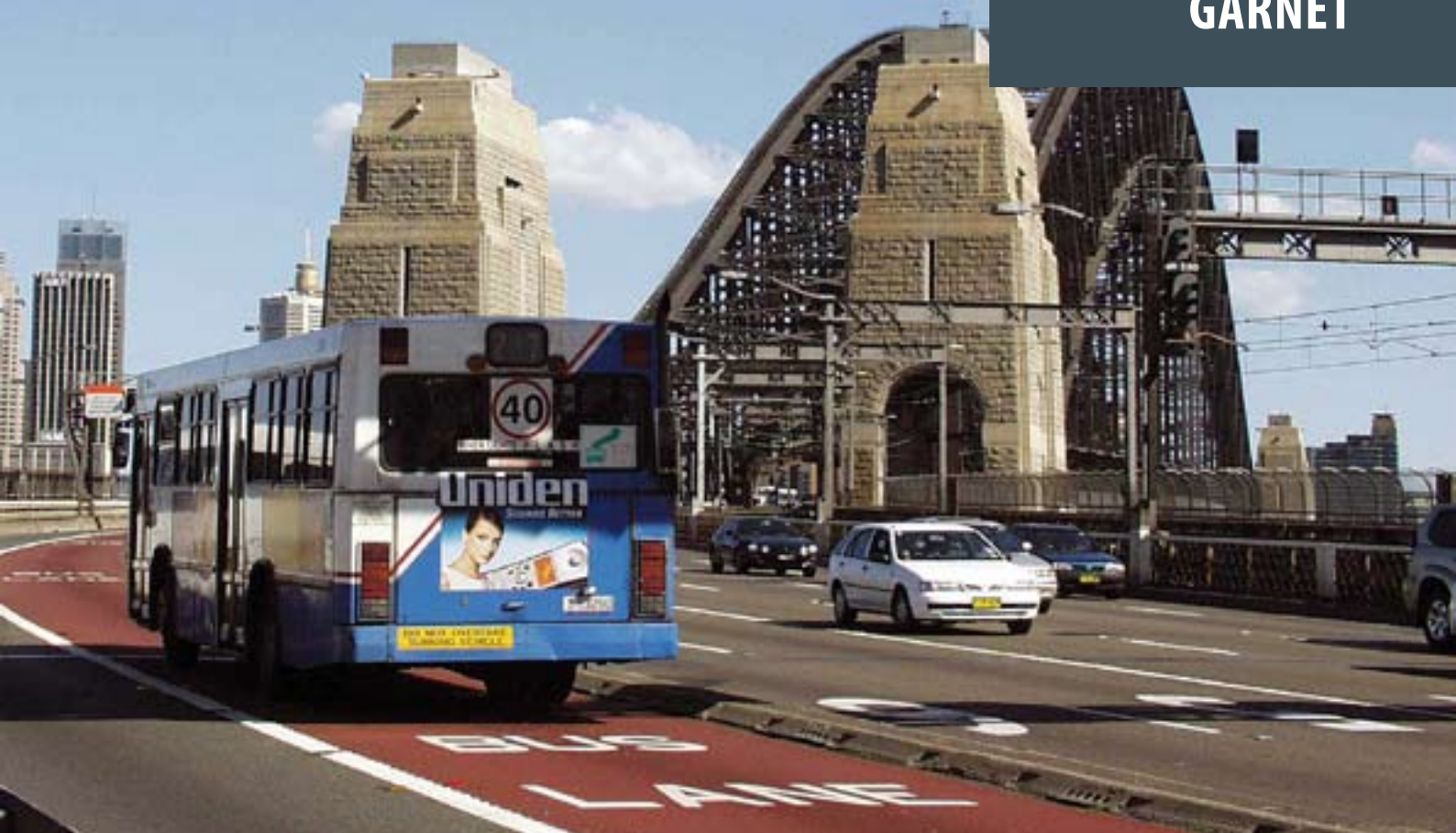
Photograph 7. Garnet used as skid-resistant aggregate in bus lane surface, Sydney Harbour Bridge.