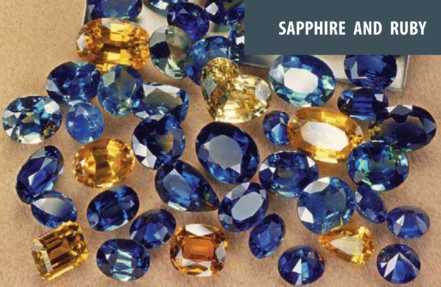
Photograph 19. Cut blue and gold New England region sapphires. New South Wales has been one of the world's principal suppliers of sapphires. Sapphires have traditionally been recovered from the Inverell and Glen Innes regions.