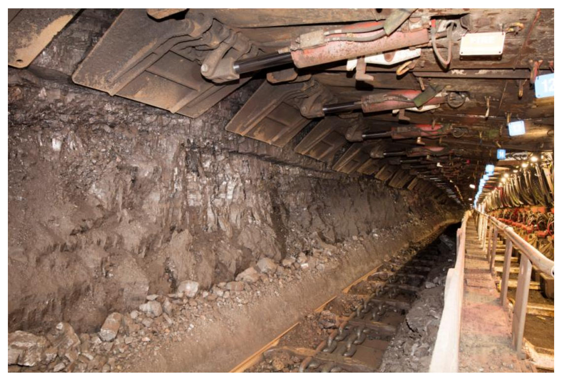
Figure 2: Face condition in burst area, showing the depth of rib blow out (note that the coal had already been run off the AFC).

Figure 1: Face condition towards maingate end showing minimal signs of high abutment stress and spalling and negligible debris on the walkway side of the AFC.