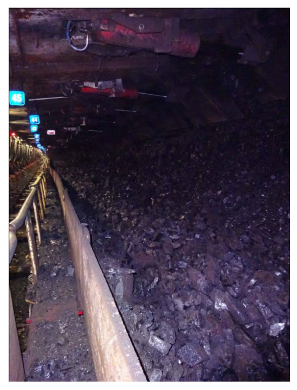
Figure 2: Ejected coal in the walkway as a result of the coal burst.<sup>ii</sup>

Figure 1: Broken coal on the face side of spill trays following the reported coal burst. ^{\rm i}